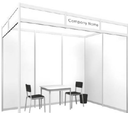
Example of B package shell scheme booth